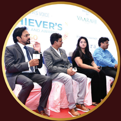
Achiever's Voice Conclave & Awards - 2025 (Entrepreneurs Edition)