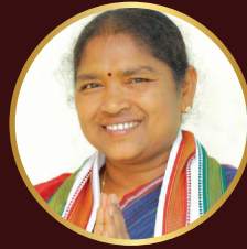
Smt. Seethakka Garu

Minister of Animal Husbandry and Sports, Member of Telangana Legislative Assembly