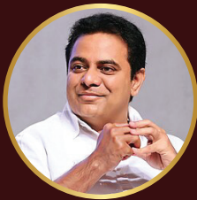
Shri. K. T. Rama Rao Garu

Former Health & Finance Minister - Govt Telangana Member of the Lok Sabha