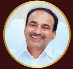
Shri. Etela Rajender Garu

Minister of Women and Child Welfare of Telangana