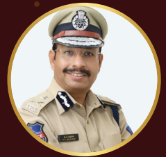
Shri. VC Sajjanar, IPS

Former Health Minister Of Telangana MLA - Siddipet