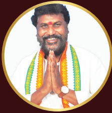
Shri. Adluri Laxman Kumar Garu

Minister for Minorities Welfare of Telangana