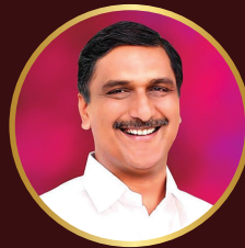
Shri. T. Harish Rao Garu

Former Deputy C.M (Govt. of Telangana) MLA Station Ghanpur