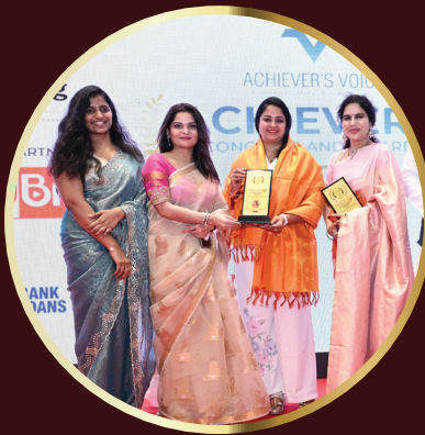
Achiever's Voice Conclave & Awards - 2025 (Women Leaders Edition)