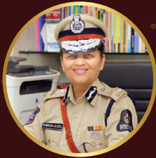
Shri. Shikha Goel, IPS Garu

Commissioner of the Hyderabad City Police - Telangana