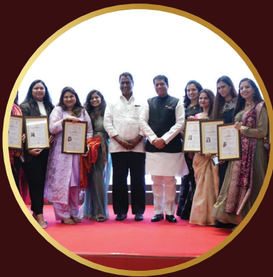
Achiever's Voice Conclave & Awards - 2025 (Influencers Edition)